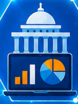
AI-Assisted Block Themes Image